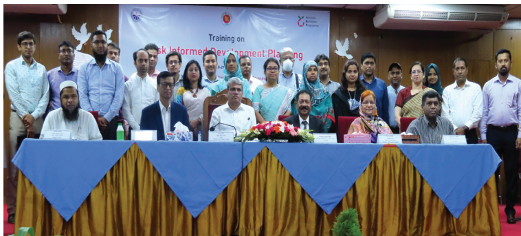
Secretary, Planning Division and Director General, NAPD along with the training participants in closing session

NRP-PD Part organized three training courses on Risk Informed Development Planning from April-June 2022 in association with National Academy for Planning and Development (NAPD) and BCS Administration Academy. A total of 63 GoB officials participated in the training courses.