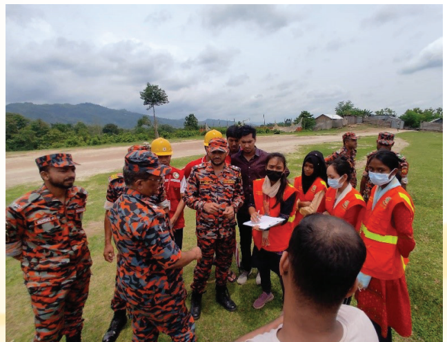
UCVs of Rangamati participated and supported FSCD for organizing drill on Fire, Rescue operation