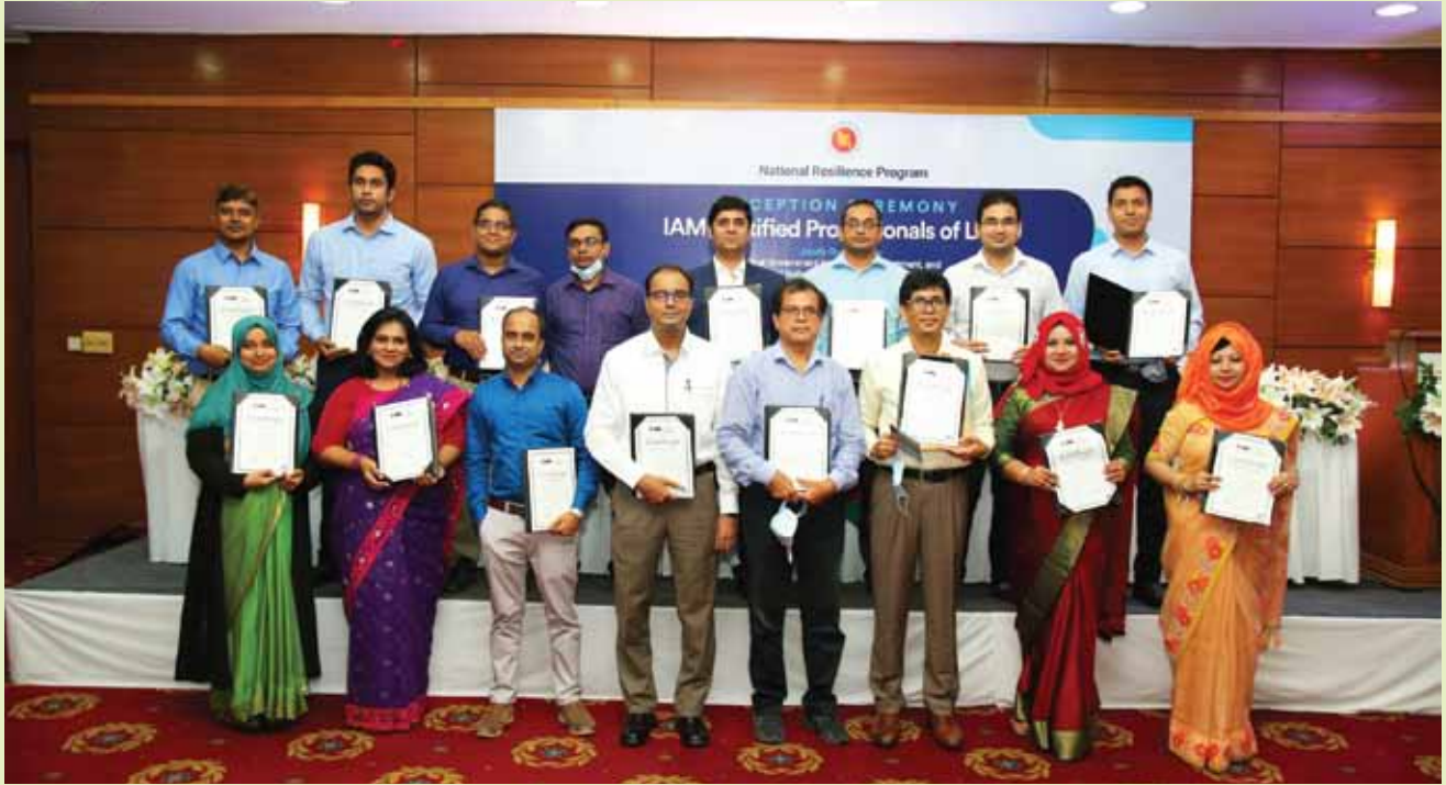
Certified young professionals and also a part of the trainers' pool

The journey towards the creation of the Basic Course on Asset Management and a pool of trainers who are IAM Certified is a result of tremendous efforts by a team of visionaries representing the Government of Bangladesh and UN entities. Today, LGED has 19 IAM Certified trainers who are successfully able to train a larger pool of trainees from different government departments. Let us walk through some of the milestones: