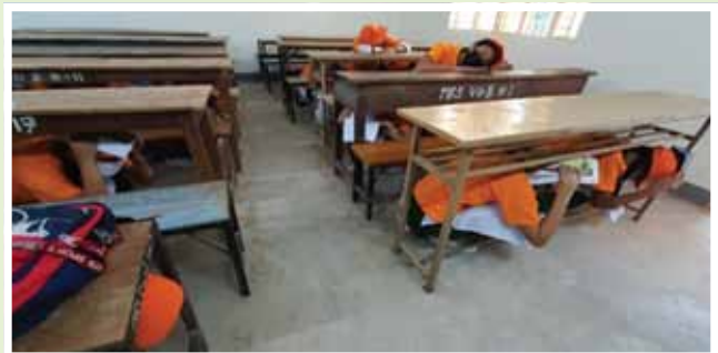
Search and rescue exercise by UCVs and FSCD. Duck, cover, hold exercise at school in Rangamati